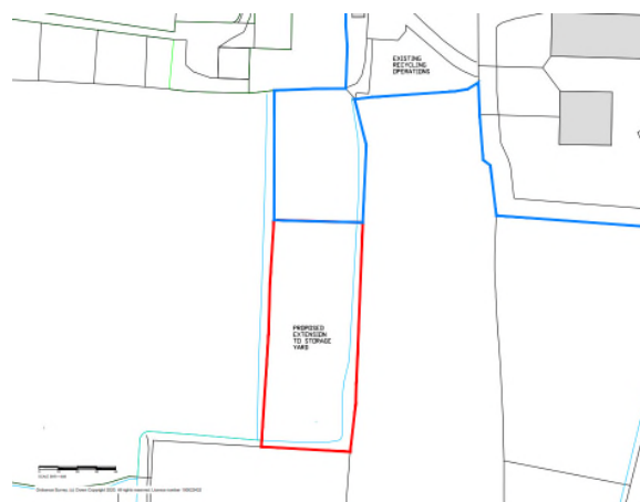
Fig. 2 – Proposed Site Plan

The extended storage area lies outside the historic extent of the waste wood processing plant in the open countryside. Lock's Yard (the front part of the site) has operated as a wood recycling facility for a number of years and it was extended to include the adjacent former Bryncethin Nurseries site in 2014. Following a fire in 2016, the previous operator moved the unprocessed waste wood from Lock's Yard to this unauthorised site in order to save the wood and to stop the spread of the fire.